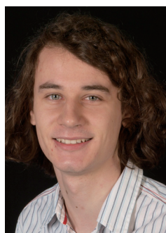
P. Scholze (Universität Bonn)

Two Lectures on Floer Theory and Its Topological Applications