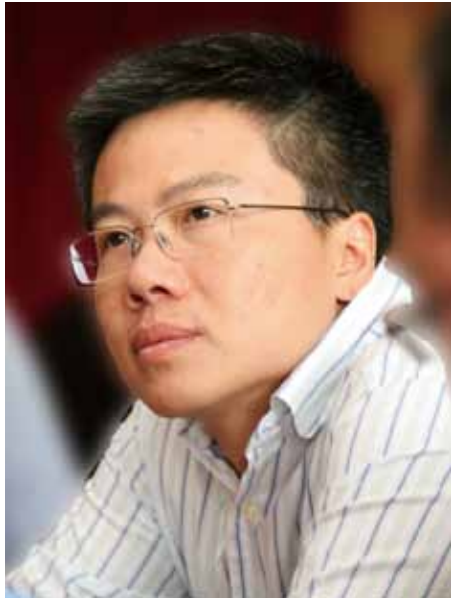
Ngô Bảo Châu (The University of Chicago)

Place : Graduate School of Mathematical Sciences, The University of Tokyo