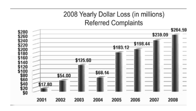
Figure 1. Dollar loss of referred complaints was at an all time high in 2008, $264.59 million, exceeding last year's record breaking dollar loss of $239.09 million

These numbers presented here are only the known facts. The real numbers regarding the attacks and losses are unknown, making the criminals very happy since the most valuable in-formation stolen is the data no one knows has been stolen.