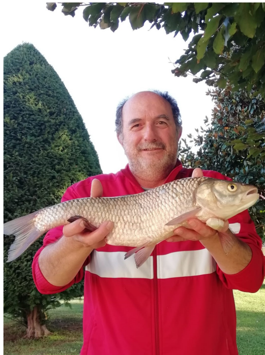
Figure 3: Happy fisherman