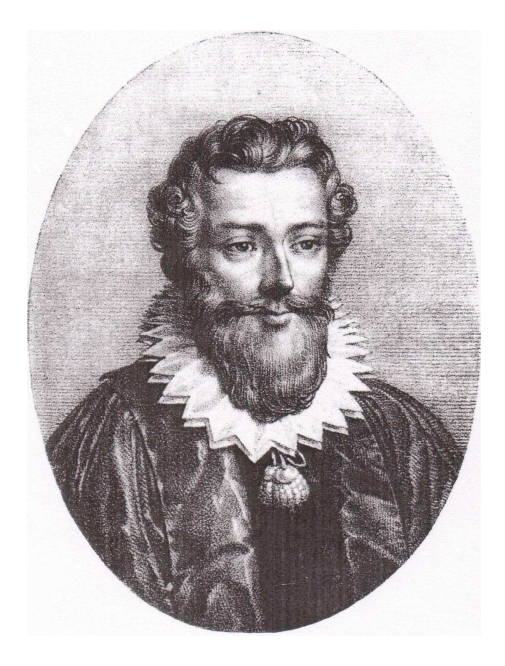
FIGURE 8. François Viète (Fontenay-le-Comte 1540 – Paris 1603)

But why should we be limited to sums of positive cubes? We can generalize the problem, allowing sums of positive or negative cubes, these are known as Cabtaxi numbers. Their story starts before that of the Taxicab numbers.