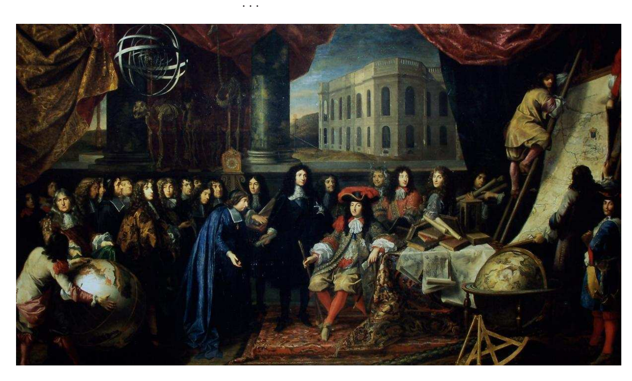
FIGURE 1: Colbert presenting the founding members of the Académie Royale des Sciences to Louis XIV, in 1666. Bernard Frenicle de Bessy (Paris circa 1605 – Paris 1675), one of the founding members, is probably among the people on the left. [Painting by Henri Testelin, Musée du Château de Versailles, MV 2074].

Treuver deux nombres cubes dont la fumme soit esgal a deux autres nombres cubes. Nempe fic; 1729 = C9 + C10 = C1 + C12. 4104 = C9 + C15 = C2 + C16.