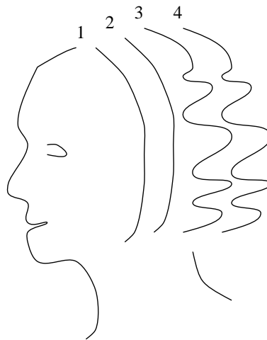
Figure 1: Fellow travellers

Figure 1 gives an informal definition of fellow travelling; we give a more formal definition below. In the figure, the two pairs of paths labelled 1 and 2, and