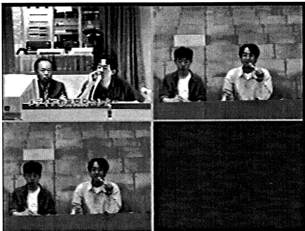
図 2: SCS の画面

A new real time mathematical communication with using computer algebra systems must be introduced.