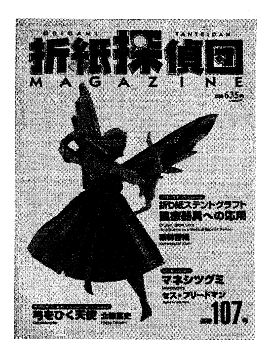
Figure 1: An "angel" designed and folded by Takashi Hojyo on the cover of [1]. (http://www.origami.gr.jp/ Magazine/Index/103-108.html)

the paper. That is, we assume that the paper corresponds to an interval [0.n+1], n creases are placed at each integer point i with 1 \leq i \leq n , and each integer point is assigned to M (mountain) or V (valley) which is the target folded state. We aim to fold the paper and make it "well-creased" according to the assignment. More precisely, each integer point memorizes its last folded state (M or V) made at the point, and we have to make the creases' folded states fit the given assignment.