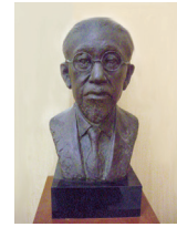
Teiji Takagi (1875-1960)