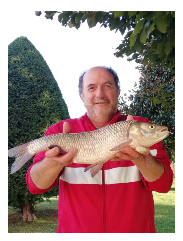
Figure 3: Happy fisherman